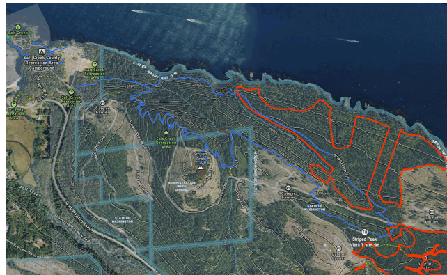
OnX Map showing the location of the Strait Slope / Striped Peak Trail (in blue) and location of planned timber sales - Birds Eye View and Tiger Stripes Sorts (in red). The Salt Creek Recreation Area and Tongue Point are to the left (west) of the trail.

The Washington State Department of Natural Resources (DNR) plans to log approximately 300 acres of forest in the Striped Peak Recreation Area, which they manage. It is located next to the Salt Creek Recreation Area, a Clallam County park. Two timber sales, "Tiger Stripes" and "Bird's Eye View," would clearcut large portions of this rare coastal forest and cut across a big portion of the Striped Peak Trail / Straight Slope Trail. The Tiger Stripes sale has already been auctioned to Murphy Company, and the Bird's Eye View sale (originally not scheduled until 2028) could move forward in early 2027 unless we act now.